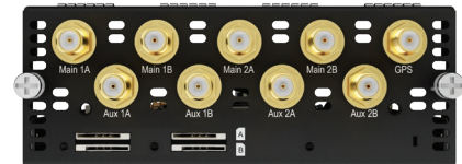
2x LTE-A Pro Module (CAT-18)