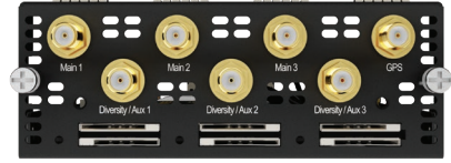
3x LTE-A Module (EXM-3LTEA)